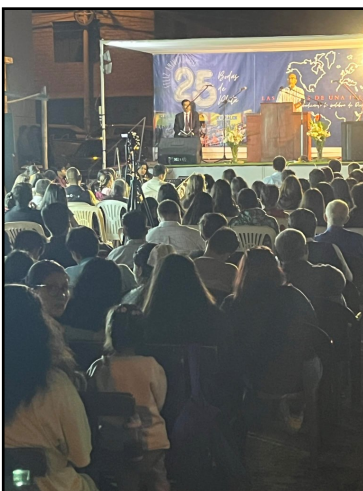
Open-air evangelistic meetings at New Jerusalem

Then, on to Peru for the 25 th anniversary of the New Jerusalem Baptist Church of Trujillo. It was glorious! Part of the four-day celebration included youth and couples' sessions, and evangelistic meetings. A whole city block was closed off, lights were hung, speakers were set up, and countless invitations were handed out by church members. The labor brought forth many who heard the gospel. Even the local bar stopped serving alcohol during the services! This church has started two other local churches, and it is a great testimony of God's blessing.