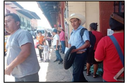
Street canvassing in Zacapoaxtla,