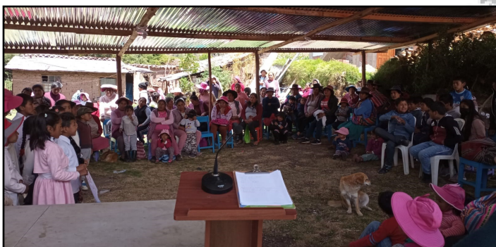
Children's Bible club in Yaurisque, Peru ( Sacarias Ccopa )

Children's Day festivities hosted by Miguel Saboyá's church in Bogotá, Colombia brought in 50 neighborhood children. The church also celebrated its 2-year anniversary this month!